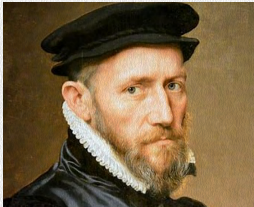
Sir Thomas Gresham

G resham College is an extraordinary and ancient educational institution. Founded by the will of Sir Thomas Gresham in 1579, it has managed to keep going, despite numerous vicissitudes for over 400 years, and has lately had a renaissance.